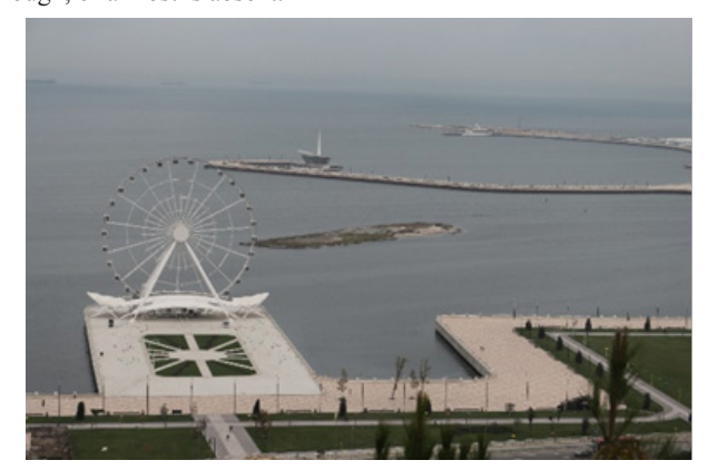
Figure I The area of the Sabail fortress.

levels. There is no doubt that it was also exist the intermediate sea level. Quite possible discovered construction was such intermediate port, which can be only assumed. So far, it can be only assumed and, most likely, guess. Today it is impossible to determine the century of the discovered construction since the level of the last 2 thousand years Caspian Sea level has changed four times. Available written information relevant to Baku history for the indicated periods is not enough, or almost is absent.