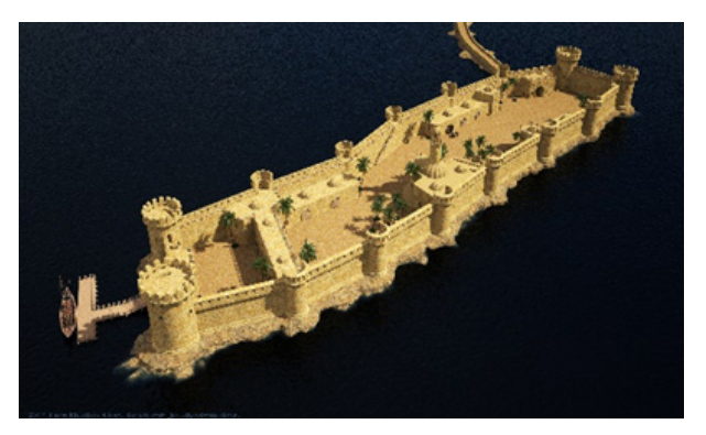
Figure 4 Sabail fortress regeneration.

A seabed relief of a northern part of the Caspian Sea is the shallow wavy plain with banks and accumulative islands, the average depth of the Northern Caspian Sea is about 4–8 meters with the maximum depth 25 meters. The Mangyshlaksky threshold separates the Northern Caspian Sea from the Average Caspian. The Central Caspian Sea rather deep-water, where the depth of the sea in the Derbent hollow reaches 788 meters. The Apsheron threshold divides the Central and Southern Caspian Sea. The Southern Caspian Sea is considered deepwater where sea depth in the Southern Caspian hollow reaches 1025 meters from the surface of the Caspian Sea. 12,13 It is vital to consider all circumstance of above factors during regeneration of the Sabail Fortress. It is suggested example of regeneration of the ancient monument in the selected area (Figure 4). The next item of the paper is dedicated of method for successful restoration of the Sabail Fortress.