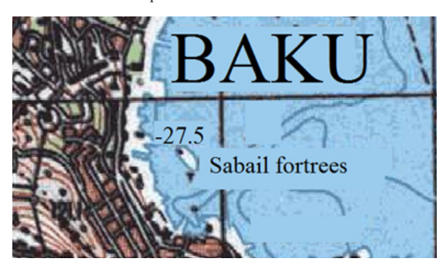
Figure 2 The map of selected area.

Reconstruction such type of infrastructure demands to provide all necessary maintenances such as power supply, water supply, the sewerage and any other related for operation and functioning of facility of communication systems. Figure 2 shows location of the selected area on the map of the Sabail fortress.