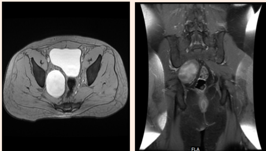
Figure 2 & 3: MRI, abdomen with gadolinium revealed T1 hypotense, T2/STIR heterointense enhancement within the lesion.