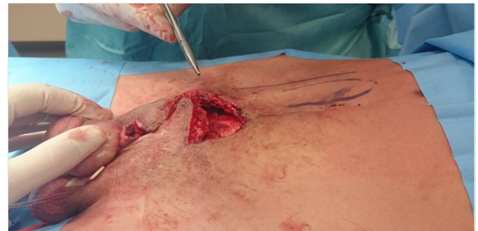
Figure 2 Abdominal wall Z-plasty.

With the aid of the plastic surgeon, an infra-umbilical, abdominal wall Z-plasty was performed. The skin and subcutaneous tissue were mobilized to widen the pre-pubic area and to diminish the dorsal angulation. As such an excellent result was achieved and the erectile angulation was reduced, making intercourse possible. The patient returned home the next day and was very satisfied with the functional and aesthetic result (Figure 1-3).