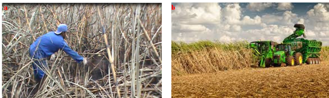
Figure 2 sugarcane manual harvest x mechanization. 11