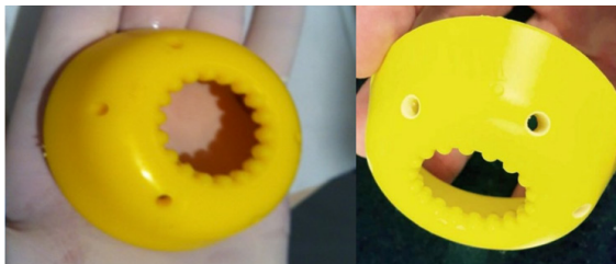
Figure 2 A single-size Brazilian CP usually inserted, similar to Arabin pessary, with an irregular internal orifice, with measures of 60×20×27mm (major diameter x height x minor diameter).

delivery. There is a lack of evidence about this issue and new studies with a cervical pessary and preterm labor have been conceived to check this aspect. Actually, because of CP placement, the diagnosis of preterm labor is exclusively by abdominal contraction, thus the cervix is always closed by pessary, and more comprehension about the physiopathology of the labor with pessary is necessary.