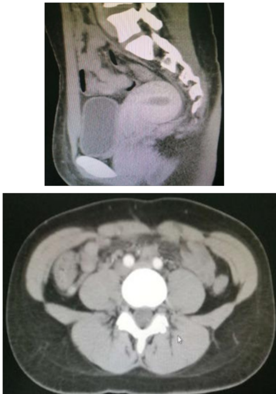
Figure 1 CT Scan of pelvis: The volume of the uterus is full, density of uterine wall is well-distributed, endometrium slightly thickened, enhanced scan shows no lesions, solid-cystic hypodense shadow was seen in the right-sided adnexa, cystic lesion which is in the size of 4.3cm X 3.8cm X 5.3cm is predominant. In the cystic lesion, we can see line like separate shadow, papillary nodules can be seen in its top wall; papillary nodules are in the size of 1.0cm X 0.6cm X 0.6cm. The demarcation between the lesion and the bladder or adjacent intestine was clear. No lymphadenopathy noted. 20

nodule resection and endometrial curettage.