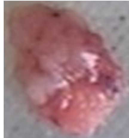
Figure 2 Pathology: Gross appearance of right ovarian tumor with papillary surface: Gray red tissue measuring 1cm X 0.7cm X 0.4cm

Omentum and bilateral lymph nodes were negative for metastasis. Therefore, with SBT limited to the surface of one ovary it was staged as IC2, which is defined as a tumor that is on the outer surface of at least one of the ovaries or fallopian tubes or the capsule has ruptured before surgery. 8