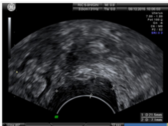
Figure 1 Sonography showing an endometriosis focus in the recto-sigmoid colon.

A pelvic ultrasound revealed the presence of 1-cm endometriomas in three of the four laparoscopic trocar sites, a 3-cm right ovarian endometrioid cyst, a 17x9mm endometriosis focus in the vaginal vault, and a 21x7mm endometriosis focus in the recto-sigmoid colon (Figure 1). An MRI confirmed these findings and demonstrated a severe deep pelvic endometriosis focus in the vaginal vault with extension into the recto-sigmoid colon and bladder peritoneal surfaces. It also evidenced bilateral endometriomas (Figure 2). Serum CA-125 was 33.5 IU/mL (normal range <30 IU/mL) and CA-19.9 was 45.6 IU/mL (normal range <37 IU/mL).