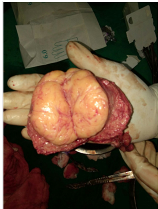
Figure 1 Gross Specimen: Cut section of uterus with lipoma in situ.

cavity showed an encapsulated lesion composed of lobules of mature adipocytes, separated by thin fibrous septae. No evidence of malignancy.