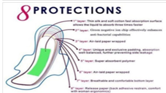
Figure 3 Anion sanitary napkins.

The ideal is the screen for the infections like Chlamydia, Ureaplasma, Mycoplasma before pregnancy to avoid dramatic consequences (late miscarriage, preterm birth).