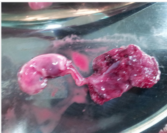
Figure 3 Gross picture of foetus & placenta attached with ovarian tissue.

Intra operative and immediate postoperative patient received 2 units of blood transfusion. Her postoperative period was uneventful and was discharged 3 day after operation. On histopathological examination, villous structures embedded in the ovarian tissue were seen, which was confirmatory of primary ovarian pregnancy (Figure 4).