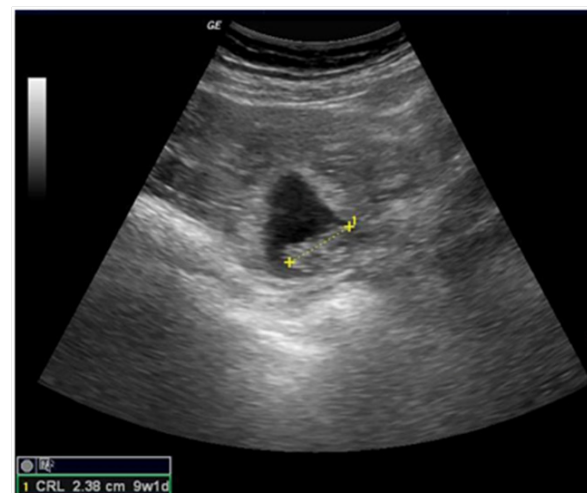
Figure 1 Ultrasonography showing gestational sac with foetal pole of 9weeks 1day in right adnexa.

region close to right ovary. Foetal cardiac activity was not present (Figure 1). Uterus was normal in size and echotexture with normal endometrial thickness (Figure 2a). Gross free fluid was noted in peritoneal cavity which on ultrasound guided aspiration came out to be blood suggesting hemoperitoneum (Figure 2b). Ultrasonographic features were consistent with ruptured right adnexal ectopic gestation with possibility of ruptured right ovarian ectopic pregnancy. Her initial blood results were Blood group B positive and Hemoglobin (Hb) 8.7 gm%.