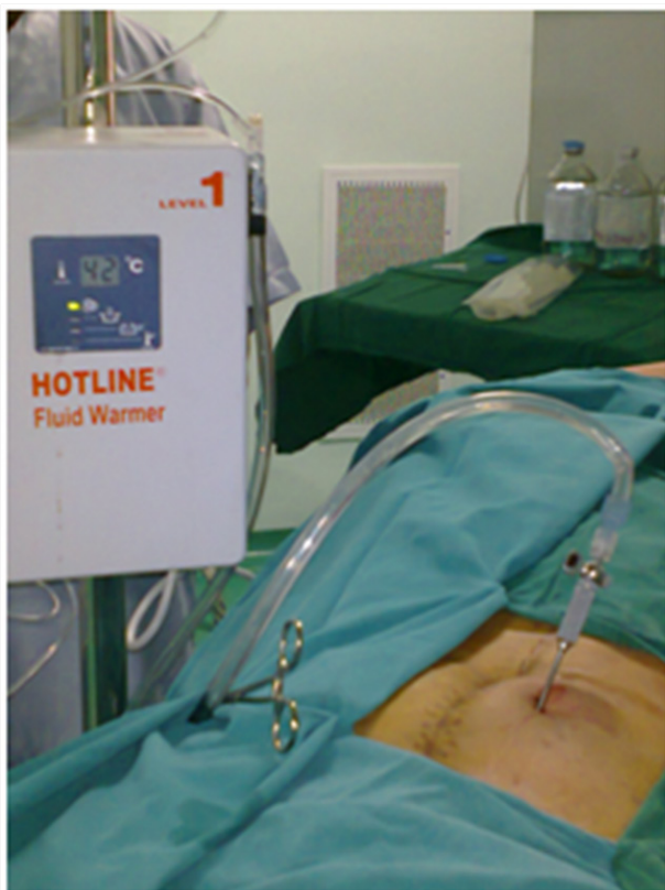
Figure 2 This shows method of instillation of warm chemotherapy fluid using Veress needle and IV Fluid warmer device.