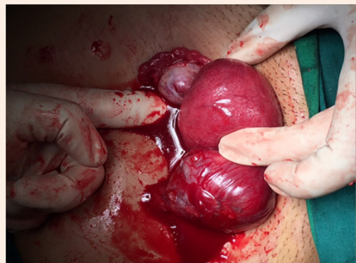
Figure 1: Right cornual pregnancy with impending rapture.