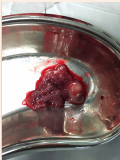
Figure 3: Specimen following procedure.