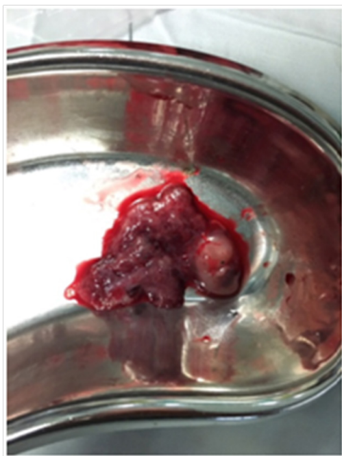
Figure 3 Specimen following procedure.

Surgical management can be laparotomy, laparoscopy or hysteroscopy.