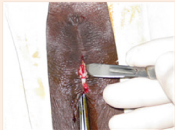
Figure 2: Infibulation.

De-fibulation: Infibulation is narrowing of the vaginal orifice with creation of a covering seal by cutting and suturing the labia minora and labia majora together on both sides, after excision of the clitoris (infibulation), women who have undergone type III mutilation require a de-fibulation (cutting the skin seal) before delivery or vaginal surgery. Functional improvements have been described after this de-fibulation procedure in many women with type III [13,14,16-18]. (Figure 2 & 3)