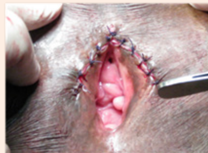
Figure 3: De-fibulation

Clitoral Reconstructive Surgery: Restoring clitoral anatomy and improve clitoral function. Most patients had undergone type II mutilation (removal of the clitoris glans and part of the labia minora). The skin covering the clitoris stump was cut longitudinally with knife or scissors, and the fibrous tissue around the clitoral stump removed. The suspensory ligament was cut close to the bone to allow sufficient downward freeing and mobilization of the clitoris, bringing it to the original glans' anatomical position; the dorsal neurovascular bundle was preserved. PDS sutures were used to hold the tip of the neo-clitoris inferiorly at 5 & 7 O'clock to the vestibular skin to prevent retraction; additional interrupted sutures were carefully placed fixing the sides of the clitoral shaft to underlying structures. (Figures 4 & 5)