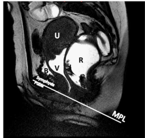
Figure 1 MR image obtained at rest. Midsagittal FIESTA acquisition through the pelvis of a 43 year old woman with symptoms of pelvic organ prolapse. The image shows the reference line used. MPL—Mid Pubic Line; B—Bladder; V—Vagina; U - Uterus; R—Rectum.

A major obstacle in comparing the POP-Q system to an MRI defecography evaluation is the selection of a reference point available on both MRI and clinical exam. For purposes of this study, we selected the point at which the midpubic line intersects the longitudinal axis of the vagina as the radiologic representation of the hymen (Figure 1). The use of the midpubic line has been described as a landmark for MRI staging of pelvic organ prolapse. Fresh cadaver data has established the midpubic line as a reliable indicator of the clinical hymen, which is the landmark used for clinical scoring. 4