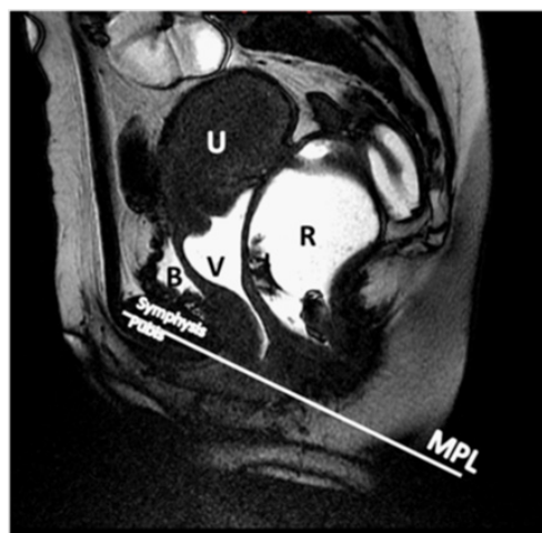
Figure 2 MR image obtained at rest. Midsagittal FIESTA acquisition through the pelvis of a 43 year old woman with symptoms of pelvic organ prolapse. The black arrows designate resting POP-Q points on anterior vaginal wall (Ba), posterior vaginal wall (Bp), and cervix (C). The white arrow represents the point at which the midpubic line intersects the long axis of the vagina (reference point). MPL - Mid Pubic Line; B-Bladder; V-Vagina; U-Uterus; R-Rectum.

Prolapse of the anterior vaginal wall, cervix or cuff, and posterior vaginal wall was recorded in centimeters by calculating the difference between the coordinates of maximal prolapse and the hymen (Figure 3).