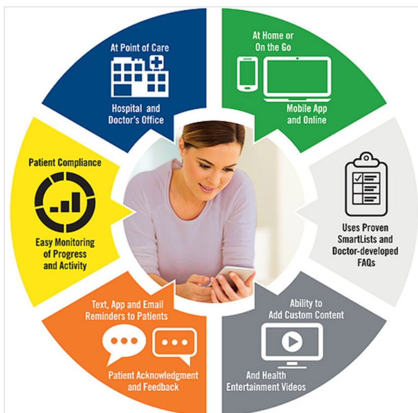
Figure 3 Compliance monitoring. 88 An increase in the accessibility of health system data and advancements in electronic information of medication use has permitted new insight into patients' medication behavior. The increased availability of big data in health has enabled the utilization of quality performance measurement across various aspects. Specially, in pharmacy, large data sets of prescription dispensing information, also known as pharmacy claims or prescription refill data, have become more readily available from the ease of electronic information, making it useful for analyzing medication adherence and providing a viable and economical approach for its estimation in real time. Frequently revealed in long-term monitoring are declining trends in adherence, indicating the issue of maintaining adherence over time as crucial as improving adherence at a cross-sectional time point. Instant feedback during the dispensing process can allow the monitoring of patient adherence in real-time, especially by community pharmacists, and therefore, trigger adherence interventions when suboptimal adherence levels are identified. Interventions to improve medication adherence in research projects delivered by community pharmacists have been shown to be more effective.

as from the increased sales resulting from the larger number of prescriptions being dispensed. Finally, society and the health care system benefit as a result of fewer problems associated with noncompliance. Although an increase in compliance will result in more prescriptions being dispensed and a higher level of expenditures for prescription medications, this increase in costs will be more than offset by a reduction in costs (e.g., physician visits, hospitalizations) attributable to problems due to noncompliance. 89,90