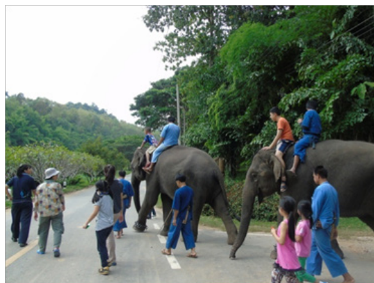
Figure 9 Riding an elephant is a means to learn motor planning as well as improving motor control and balance.