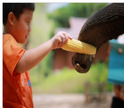
Figure 2 A Child focuses on an elephant while feeding it with corn.