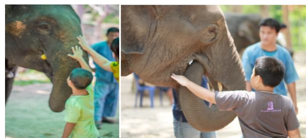
Figures 3 & 4 Touching an elephant is a new experience.