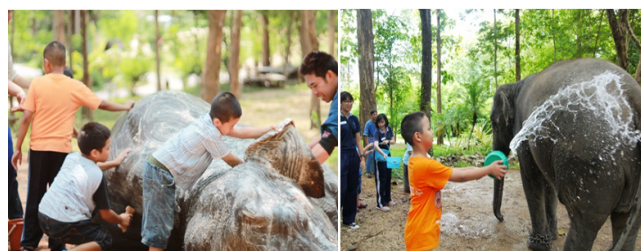
Figures 5 & 6 Taking care and bathing an elephant as a new role for children.