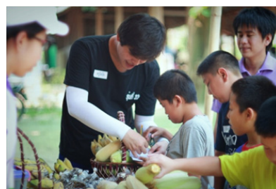
Figure 1 Buying sugar cane, banana, water melon, cereal, sunflower seed etc. for an elephant buddy.

week duration. The Berry VMI 14 the postural control record form were tested before and after the treatment program. The results showed that the visual motor integration of the experimental group was significantly different from that of the control group ( U=13.50 , p=0.04 ). Activities in Thai Elephant Assisted Therapy Program are composed of activities such as buying elephant food, feeding elephants, bathing elephants, playing games with elephants, riding elephants, elephant arts and crafts and relaxation. Some of these activities are shown in Figure 1-9.