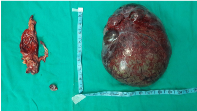
Figure 3 Showing omental cyst, omentum, and ovarian biopsy.

On doing laparotomy the mass was not arising from ovary. Uterus and both ovaries were normal. The cystic mass was arising from omentum (Figure 3). 5,6 So simple removal of omental cyst was done and omental biopsy taken. Postoperative period was uneventful.