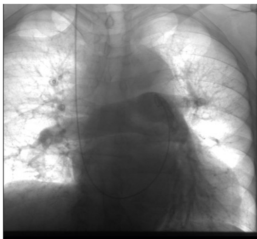
Figure 2 After regional thrombolysis therapy: angiopulmonography in dynamics from 08.07.2016 thrombus of the left lower branch of the pulmonary artery was not detected. In the parenchymal phase, all zones are contrasted evenly on both sides.