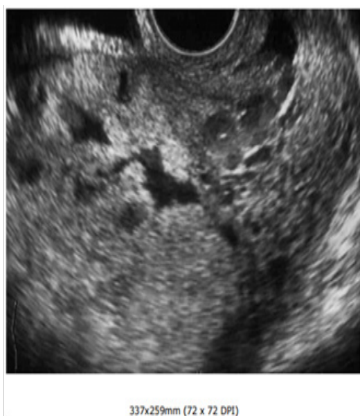
Figure 1 Maternal surface of placenta.

When PA was suspected, pelvic MRI was conducted. While using MRI, T2 weighted images were obtained in three planes (sagittal, axial and coronal). The variety of section thickness was 0,3-0,6sm and the vision fields—32-42sm. MR imaging showed a diffuse heterogeneity of placental parenchyma, uneven lacunar dilatation, Uneven, bumpy boundaries of maternal placenta, bulging of placenta with parallel thinning or defects of abutting myometrium surface and also an uterine wall deformation. Intraoperative and histopathologic verification of our diagnosis were performed. Morphologic analysis consisted of macroscopic visualisation of the removed uterus and microscopic examination of paraffin sections, colored by hematoxylin-eosin and picrotoxin (Van Gison method). To assess the possibilities of imaging diagnostics of PA, 162 multipara patients (18-42years, 27,7avg) were examined. Single C-section was performed in 16 cases, repeated (2) was conducted in 7 and third C-section was in 2cases. Are current miscarriage occurred in 104/162 patients Statistical analysis was performed using double diagnostic test and calculating specificity, sensitivity, positive and negative predictive value.