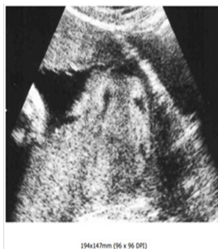
Figure 2 Thickening of the isthmus.

When PA was suspected, pelvic MRI was conducted. While using MRI, T2 weighted images were obtained in three planes (sagittal, axial and coronal). The variety of section thickness was 0,3-0,6sm and the vision fields—32-42sm. MR imaging showed a diffuse heterogeneity of placental parenchyma, uneven lacunar dilatation, Uneven, bumpy boundaries of maternal placenta, bulging of placenta with parallel thinning or defects of abutting myometrium surface and also an uterine wall deformation. Intraoperative and histopathologic verification of our diagnosis were performed. Morphologic analysis consisted of macroscopic visualisation of the removed uterus and microscopic examination of paraffin sections, colored by hematoxylin-eosin and picrotoxin (Van Gison method). To assess the possibilities of imaging diagnostics of PA, 162 multipara patients (18-42years, 27,7avg) were examined. Single C-section was performed in 16 cases, repeated (2) was conducted in 7 and third C-section was in 2cases. Are current miscarriage occurred in 104/162 patients Statistical analysis was performed using double diagnostic test and calculating specificity, sensitivity, positive and negative predictive value.