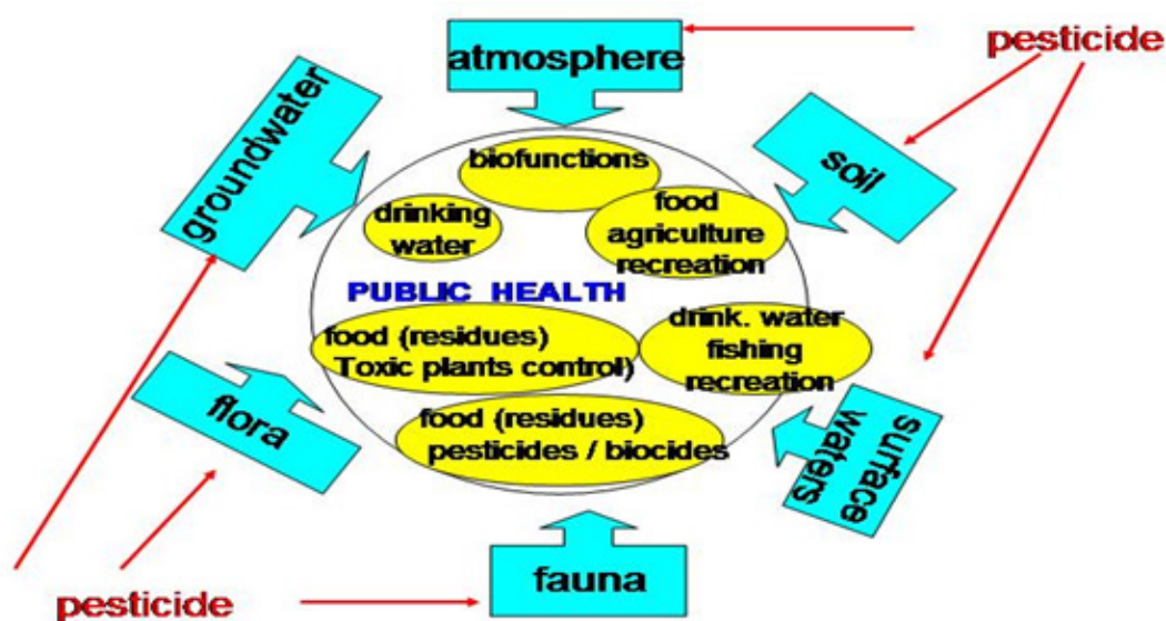
Figure 1 Indirect impact on public health due to pesticides environmental implications.

Pesticides are chemical substances that are deliberately applied mainly in agro ecosystems but reach natural ecosystems through precipitation, drift and runoff. Due to often unavoidable interactions between natural ecosystems and human activities (Figure 1) they pose a profound risk to public health (Figure 1).