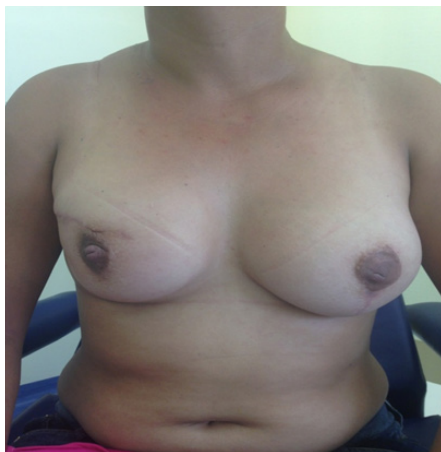
Figure 3 Reconstruction after 10 months.