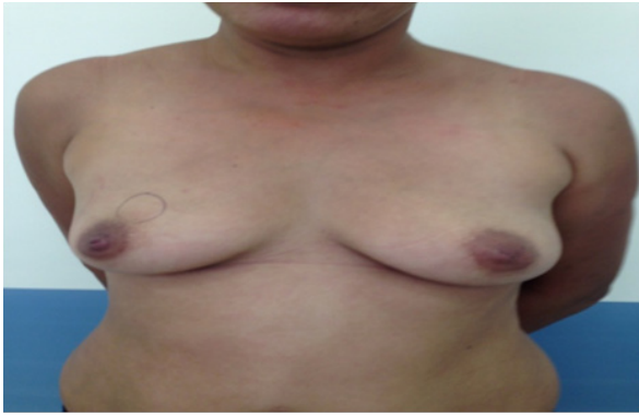
Figure 1 Premastectomy.