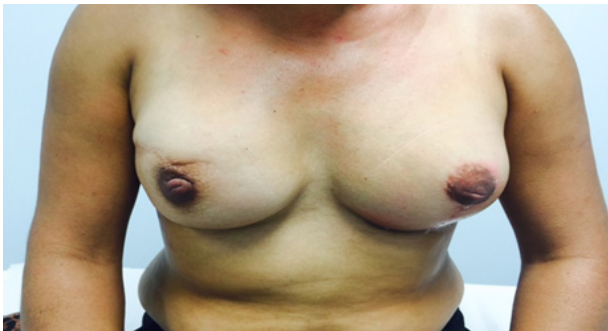
Figure 2 Post reconstruction.