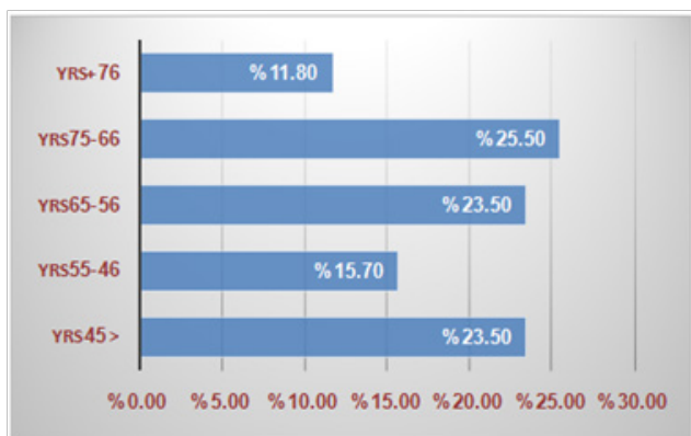
Figure 1 Description of the study population by age.

The present study retrieved 102 tissue blocks prepared from esophageal carcinoma's specimens (91patients were with squamous cell carcinoma and 11 were with adenocarcinoma). Of the 102 study subjects 55 were males and 46 were females their age ranging from 12 to 98years old with a mean age of 60years. The majority of the study populations were at the age range 66-75 years constituting 26 patients followed by age ranges, both 56-65 and <45years representing 24patients. Moreover, 16 patients were identified among age group 46-55years, hence only 12patients were found among age group 76+years, as indicated in Figure 1.