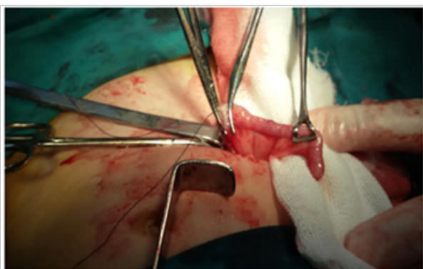
Figure 4 Reactive inflammation of appendix.