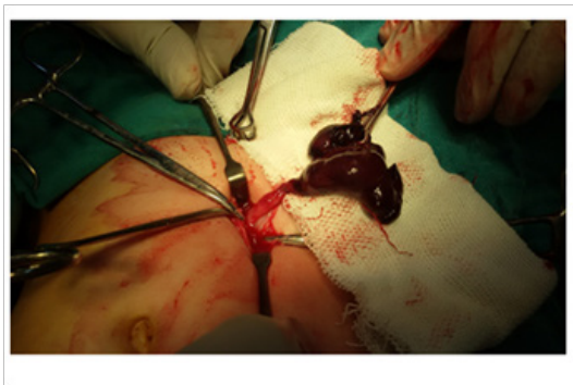
Figure 2 Infarcted ovary after de torsion and failure to restore viability.