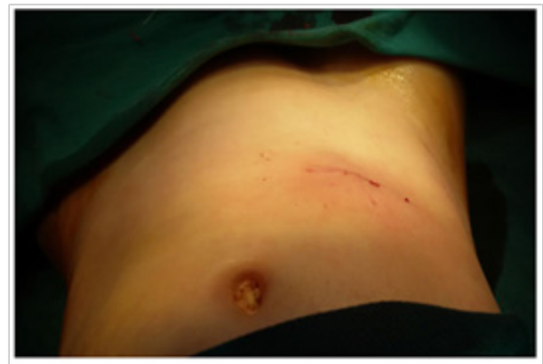
Figure 5 skin crease incision being closed subcutaneously.