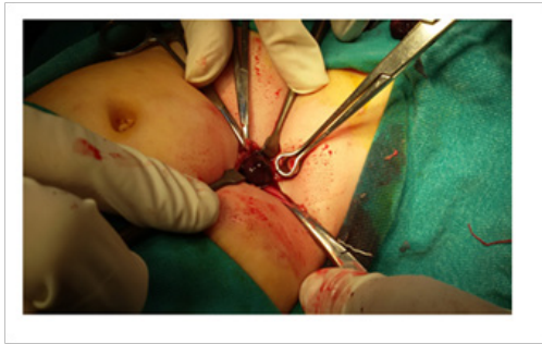
Figure 1 First appearance of infarcted ovary.