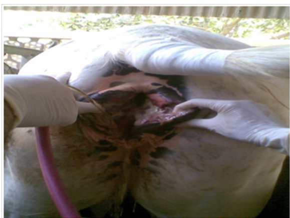
Figure 1 Showing extensive tearing of rectum and vagina.

Study was conducted on five mares between ages of 5-8years. The mares were brought to the Teaching Veterinary Clinical Complex with the history of laceration of perineum after foaling. The mares were passing faecal balls through the vagina. Entire perineal area was swollen. According to the owner the foaling was difficult and they could not get sufficient time to correct the posture of the foal and the mares expelled the foals without any external assistance. When they observed mare after foaling then perineal area was teared and swollen but the foal was normal. When the mare were examined in Teaching Veterinary Clinical Complex than it was observed that ventral wall of the rectum and dorsum of the vagina were observed to be completely teared and there was common passage for both defecation and urination (Figure 1). The mares were straining for defecation and urination. There was problem of air sucking during straining.