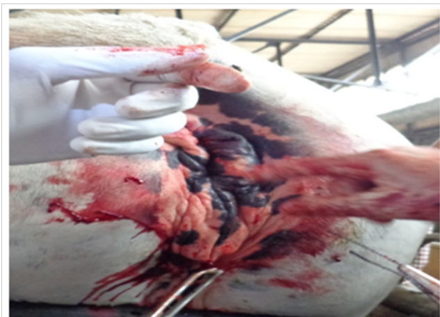
Figure 3 Showing suturing of rectum & vagina and caslick operation.