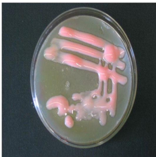
Figure 3: Hfx. mediaterranei DSM 1411 grown on solid whey-based medium.