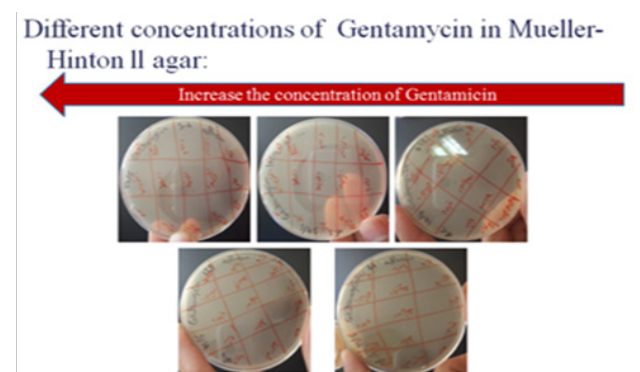
Figure 4 Increase the concentration of Gentamicin Muller-Hinton II agar.