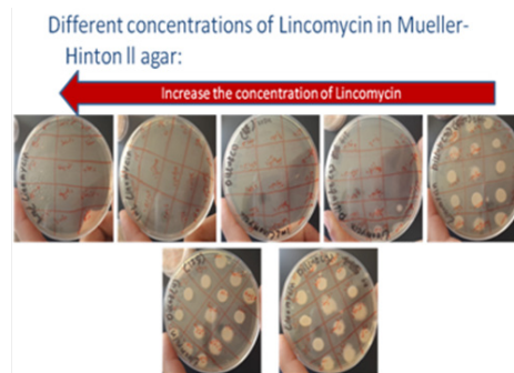
Figure 1 Increase the concentration of Lincomycin.