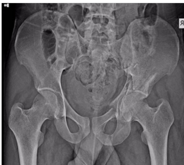
Figure 2 X ray pelvis anteroposterior at 7 weeks showing uniting fracture acetabulum and ilium with femoral head in position.

A 45 years male presented with complaints of inability to bear weight on left lower limb and walk for two days following a fall of heavy object on his back. Examination revealed limb in neutral rotation, tenderness at left groin directly and on thumping at the greater trochanter. The left greater trochanter was less prominent than right side and all the hip movements were painfully restricted. X-ray pelvis showed comminuted fracture floor of acetabulum, with medial migration of the femur head. The patient was applied heavy (10kg) upper tibial pin traction with the thigh supported on a pillow.