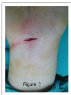
Figure 2 operations were performed through a transverse incision at the distal crease of the wrist on palmar side.

The way to have a safe mini transverse open procedure that we used in the present study is to push the scissors gently towards the longitudinal axis while the tip of the scissors directed volarly and to stop immediately when the ligament resistance suddenly decreases. The incision is also ulnar to the tendon of palmaris longus, which avoids the palmar cutaneous branch of the median nerve. This mini transverse approach is easy to master and have a short learning curve, which contribute to its low morbidity and post-operative complications.