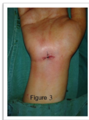
Figure 3 the skin incision is closed with one mattress 3-0 nylon suture, and dressed.

From February 2013 to March 2016; we performed 48 carpal tunnel releases on 43 patients (five cases were bilateral released on the same session), using the CTRMTA. The diagnosis of carpal tunnel syndrome was clinical and then it was confirmed by electrodiagnostic studies in not clear cases. Patients with secondary causes were excluded. All patients had failed prior conservative treatment for at least 3 months before the procedure, except one male patient had a very clear symptoms, including weakness in the hand grip, and a clear first three fingers trembling (thumb, index, and the middle finger).