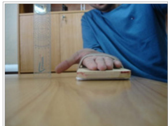
Figure 1 Video footage captures. Patient is front of the camera allows maximum supination and retropulsion of thumb.

Then, you ask the patient to make the thumb circumduction movement, taking video footage from the beginning to the end of the movement.