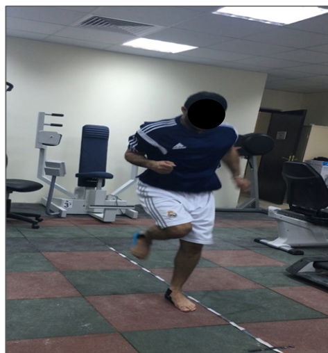
Figure 2 Single hop test

In this study, the functional performance of ankle joint was assessed by using Single hop test. The test carried out on both sound and affected sides with and without taping. In this trial, the volunteer was asked to jump forward as far as possible. The researcher recorded the distance from the toes on the starting line to the end of the jump (Figure 2). Volunteers repeated the trial for 3 times and average distance was calculated and reported. One-minute rest was allowed after each trial to avoid fatigue.