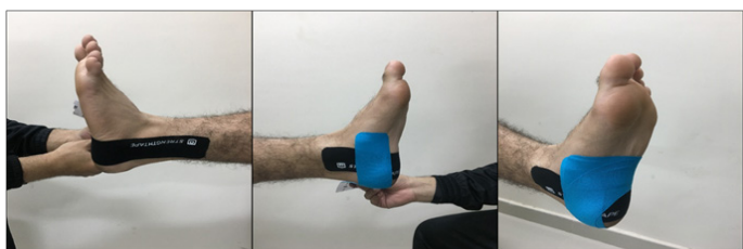
Figure 3 Application of kinesiotape for an ankle sprain according Kinesiology Tape Info Center concept.