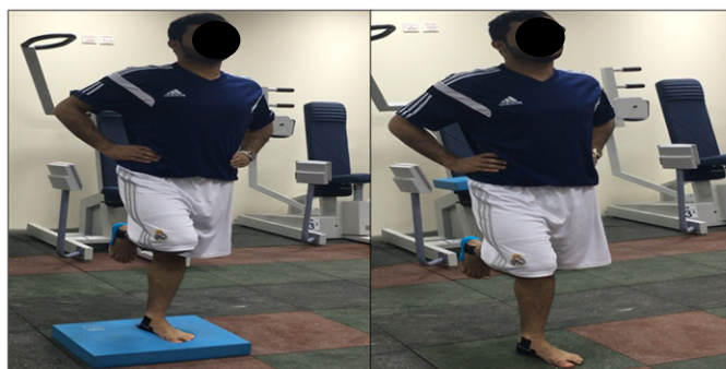
Figure 1 Balance test on stable and unstable surfaces

While in the EC tests time was stopped in two conditions, whether the subject lost his balance or opened his eyes.