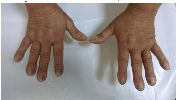
Figure 3 55-year-old female patient suffering from the expansion of her hands.

55-year-old female referred to our outpatient clinic with left drop foot after a lumbar surgical intervention. She had arthritis of the left ankle. Also, she was suffering from the expansion of her hands (Figure 3). She had total knee replacement of both knees 11 years ago. She emphasized that enlargement was insidious in onset. She had thickened skin with excessive sweating in both hands and severe clubbing of all fingers. Her son had had similar complaints. X-ray showed hypertrophic osteoarthropathy. All laboratory tests were normal except the increased sedimentation rate (ESR) and C - reactive protein levels (60mm/h, 2.71mg/L, respectively). After exclusion of GH overproduction, the patient was diagnosed as pachydermoperiostosis. Combination therapy of colchicine, acemetacin, and bisphosphonate was started. Arthritis and acute phase reactants reduced dramatically, and her symptoms improved remarkably in a short period. Muscle strength of left leg improved after rehabilitation program and dorsiflexion of left ankle increased to 3/5 (according to Medical Research Council).