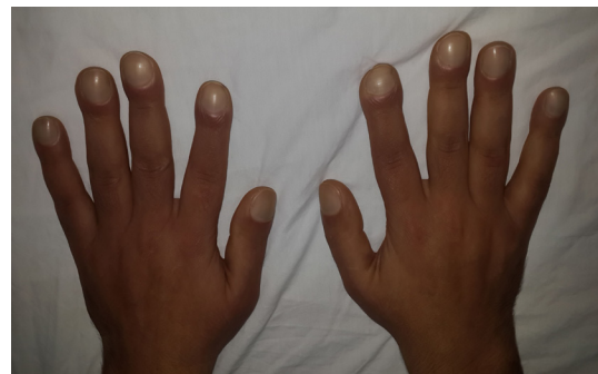
Figure 1 26 years old patient expansion of hands and feet since the age of 12.

of all fingers with enlarged distal extremities referred to our clinic. She had no arthritis. All laboratory tests were normal. Radiological examinations showed only hypertrophic osteoarthropathy.