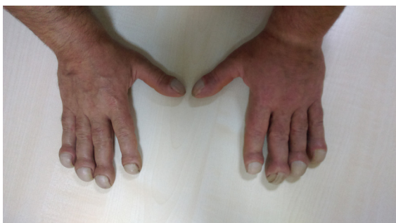
Figure 4 36-year-old patient expansion of hands.

Son of case 4, 36-year-old patient referred to our outpatient clinic with the complaint of expansion of hands (Figure 4). He had severe widespread joint pain. Visual analog scale (VAS) for pain was 8 points. There was no other evidence of arthritis. Similar to other patients, he mentioned that enlargement was insidious in onset and got worse over the years, until now. All laboratory tests including acute phase reactants were normal. X-ray showed hypertrophic osteoarthropathy and acro-osteolysis (Figure 5). Combination of colchicine, acemetacin, and bisphosphonate was started. His symptoms reduced remarkably in a few weeks. Control VAS was 1 point.