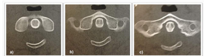
Figure 2 CT-scan (axial) showing a segmental aplasia of both hemiarches of the atlas.

after a car accident that resulted in right-sided neck pain. The patient presented no neurological deficits.