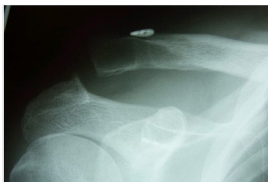
Figure 4 Grade III loss of reduction, 24 weeks after surgery.

Although the numbers of this study are limited, it appears that there is a trend toward less displacement if the surgical repair is performed within 11 days of injury. It appears that failure rates are more significant when surgery is performed more than 18 days after injury.