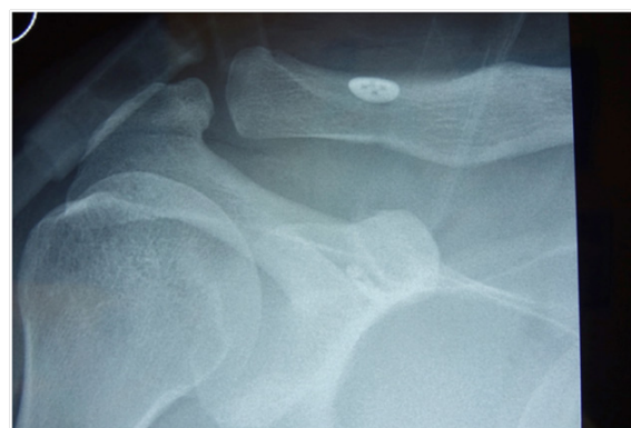
Figure 2 Intra-operative radiograph of anatomic reduction of AC separation with the Tight-rope device (Arthrex, Naples, FL).

The purpose of this study was to determine if a non-biologic AC fixation technique performed within a short time period of injury could allow for healing of the acutely torn CC ligaments.