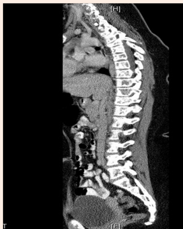
Figure 4: A CT scan with compression fractures extending from T1 to T6, with diffused mixed lytic and sclerotic osseous changes all over the skeleton.

T6, with diffused mixed lytic and sclerotic osseous changes all over the skeleton, as shown in Figure 4. Moreover, there were multiple low attenuation lesions in the mildly enlarged kidneys. An MRI of the spine showed diffused abnormal heterogeneous appearance of the bone marrow over the entire spine and the sacrum (Figure 5), but no clear cord compression was seen. Bone scintigraphy with ^{99\text{m}}\text{Tc} -methylene diphosphonate showed diffused increase in tracer uptake in the skeleton. Patchy, geographic like elevated uptake was seen in the skull (Figure 6). The patient was on Tazocin, amikacin and voriconazole, and vitamin D 50,000 IU weekly.