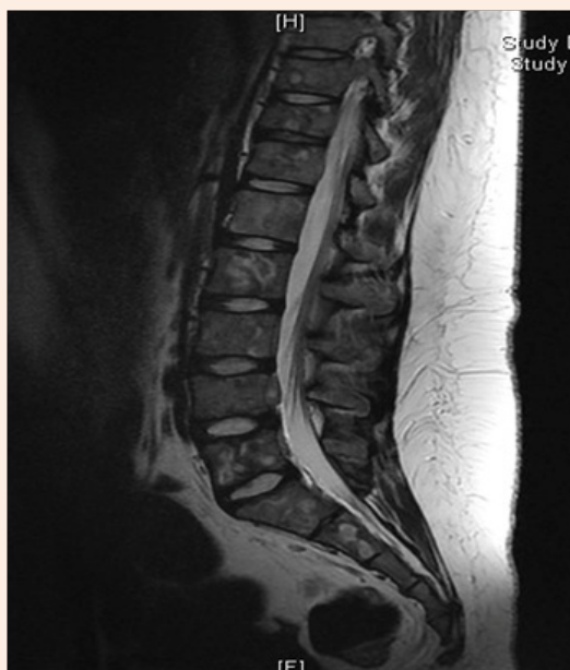
Figure 5: An MRI showing diffusely abnormal heterogeneous appearance of the bone marrow over the entire spine and the sacrum.