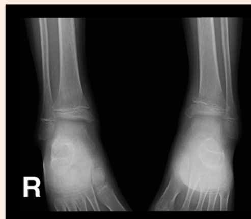
Figure 1: Anteroposterior view.

joint space bilaterally and a general decrease in bone density. Investigations showed the following values: platelet count: 91; an absolute neutrophil count: 0.2; hemoglobin: 9; and WBC: 2000. Vitamin D, calcium, and bone marrow aspiration tests revealed a marked decrease in the vitamin D level and a 97% blast in the bone marrow, as shown in Figure 3. Flow cytometry showed positivity for CD19, CD22, CD33, CD34, CD10, CD79a, TdT, CD11b, and HLA-DR. The patient was put on chemotherapy, Tazocin, cotnnoxazol, nystatin, and sodium bicarbonate. Thereafter, his lower limb pain significantly improved and he started to walk normally.