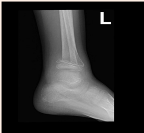
Figure 2: Lateral view.

Figures 1 & 2: Posteromedial part of the distal metaphysis of the left tibia with abnormal configuration and irregular margin.