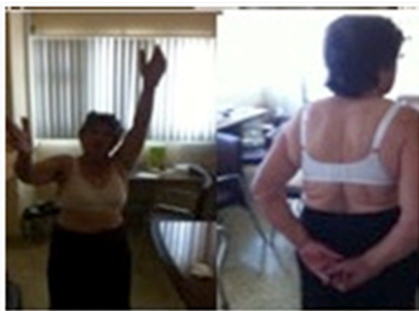
Figure 7 One-year follow up, 85° active forward flexion and internal rotation to gluteus.