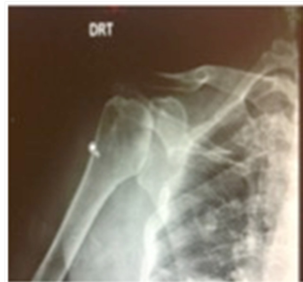
Figure 1 Right shoulder AP X-Ray demonstrating cephalic avascular necrosis.

The patient returned 1 month later, with new complaints. Numbness in the right forearm and hand with no specific nerve territory identified and with agravated pain in passive mobilisation of the arm. Denied any form of trauma or decompensation of the medical pathologies. New X-ray were made and revealed an anterior glenohumeral dislocation with an important bone loss defect in the posterior area of the humeral head. Evaluation of the CT scan confirmed those findings and revealed an intact glenoid rim.