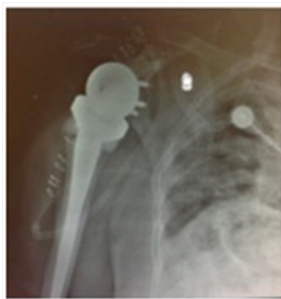
Figure 5 Postoperative right shoulder AP X-ray.

Our graft probably resorbed because of two main reasons. First from the low quality cancellous bone harvested from the necrotic head did not have the sufficient “biology boost” to consolidation and second because of the bone metabolism abnormalities that are consequence