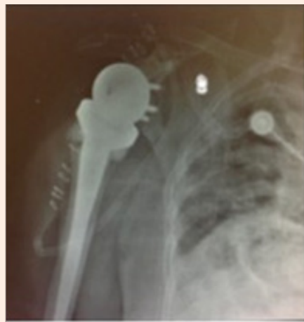
Figure 5: Postoperative right shoulder AP X-ray.