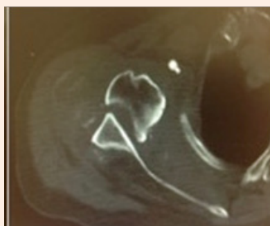
Figure 3: Right shoulder CT scan axial view, demonstrating glenohumeral anterior fixed dislocation and posterior bone loss of the humeral head.