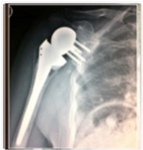
Figure 6 One-year follow up right shoulder AP X-ray, demonstrating evidence of a resorbed glenoid graft.

of Parkinson disease, and interfere with bone osteoblastic activity, and negatively influenced the consolidation of the graft. 10