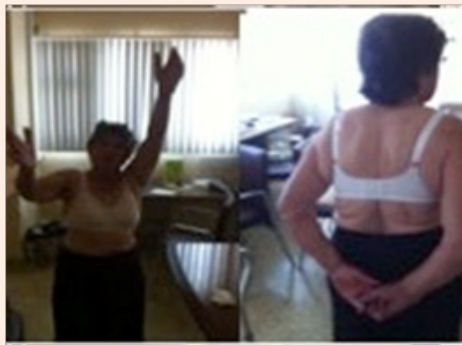
Figure 7: One-year follow up, 85° active forward flexion and internal rotation to gluteus.

ruptures and posterior head bone loss. This mechanical defect can contribute to permanent dislocation [1,5-7].