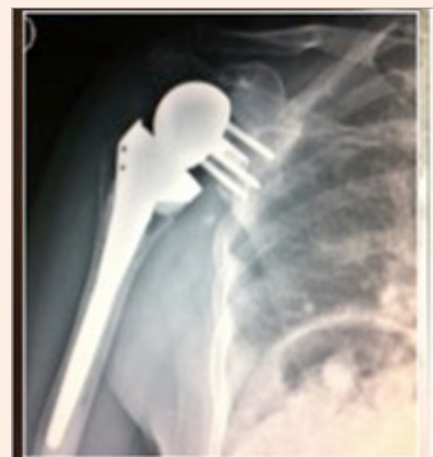
Figure 6: One-year follow up right shoulder AP X-ray, demonstrating evidence of a resorbed glenoid graft.