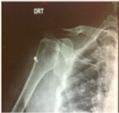
Figure 1: Right shoulder AP X-Ray demonstrating cephalic avascular necrosis.

Radiological there was an apparently resorption of the glenoid graft but the glenosphere is stable and no scapular notching is observed.