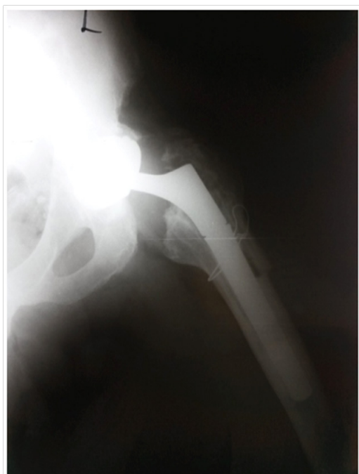
Figure 2 Plain radiograph of revision modular total hip endoprosthesis.