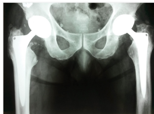
Figure 1 Plain radiograph of primary bilateral total hip endoprosthesis.