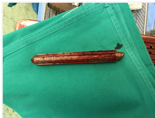
Figure 5 Intraoperative junction fracture.

identified, including increased BMI, deficient osseous support (result of trochanteric osteotomy, osteolysis or femoral stem under sizing), implant malposition and increased corrosion and metal ion release. 2-8