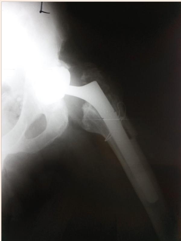
Figure 2: Plain radiograph of revision modular total hip endoprosthesis.