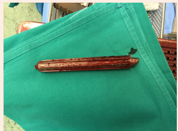
Figure 5: Intraoperative junction fracture.