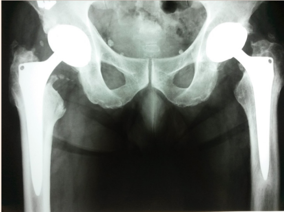
Figure 1: Plain radiograph of primary bilateral total hip endoprosthesis.

distally for 15cm. It was then followed by a transversal osteotomy 2cm below the tip of the femoral stump to allow enough space for two locking pliers. Simultaneously using a lamina spreader on the distal part, the broken stem was extracted while hammering on two locking pliers. Cementless revision femoral stem was implanted in a standard manner (Figure 6).