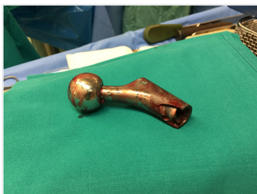
Figure 4 Intraoperative junction fracture.