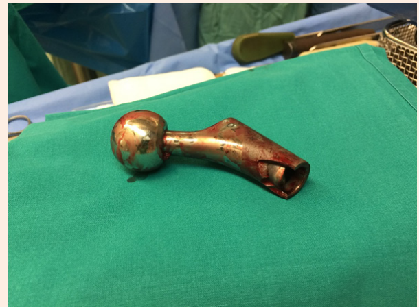
Figure 4: Intraoperative junction fracture.