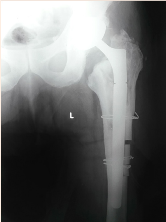
Figure 6: Plain radiograph postoperatively.