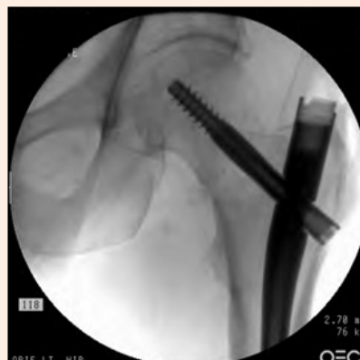
Figure 4: AP view of the left hip showing acceptable reduction and surgical fixation with an intramedullary nail.