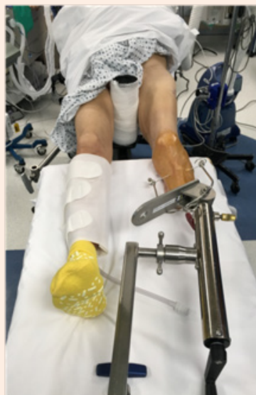
Figure 3: The disposable tibial traction arm applied to the pin and hooked the arm onto the base of the traction boot with surgical boot removed.

On post-operative follow-up, the patient initially followed up 1 month following the surgery. He complained of mild left leg pain, and erythema, swelling and tenderness of the incision. He required a wheelchair for ambulation. Plain films demonstrated no change in alignment of the fracture since surgery. He was encouraged to engage in ROM exercises as the joint is not immobilized. On the 6-month follow-up, the patient had transitioned to using a walker to assist with ambulation. X-rays showed delayed healing of the fracture, but also revealed no change in alignment of the fracture.