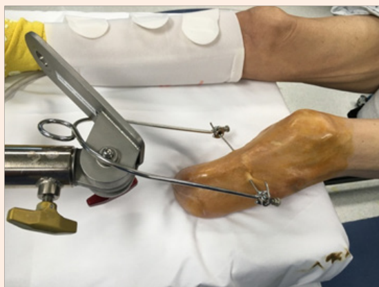
Figure 2: A tibial traction pin is placed through the stump of the patient's ipsilateral tibia 2.5cm posterior and distal to the tibial tubercle.

The patient was positioned on the fracture table (OSI Modular Table System) with a perineal post present to stabilize the patient. Initially we attempted to position the patient using the reverse surgical boot method [1,4], but ultimately felt this position compromised the ability to control the reduction and due to the boot size did not enable us to utilize any of the distal locking screws within the nail itself. We proceeded to place a tibial traction pin through the stump of the patient's ipsilateral tibia at the described insertion site 2.5cm posterior and distal to the tibial tubercle (Figure 2), under sterile conditions prior to operative preparation and draping. We then used the disposable tibial traction arm applied to the pin and hooked the arm onto the base of the traction boot with said boot removed (Figure 3). This technique allowed an assistant to control rotation, traction, and abduction/adduction of the ipsilateral leg into a position for acceptable reduction from the base of the fracture table as if the boot was in use and controlled within the limitations of the table. This setup allowed us to obtain and maintain an acceptable reduction and allowed for intraoperative freedom while inserting the IM device as well as interlock distally without any impedance or difficulty in maintaining or reduction (Figures 4 & 5).