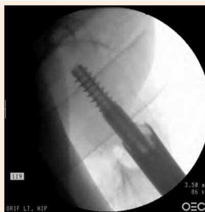
Figure 5: Lateral view of the left hip acceptable reduction and surgical fixation with an intramedullary nail.