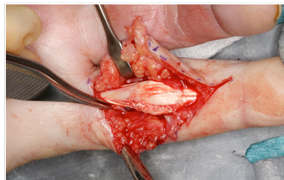
Figure 2 Thin and degenerative A3 pulley.