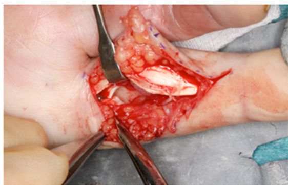
Figure 3 A2 pulley was fully released and tenoplasty of the FDP tendon distal to A2.

inflammatory process and swelling that ensues thereby leads to loss of motion in the offending digit. Triggering of the A2 pulley system is significantly less common. Nonetheless, the distal portion of the A2 pulley is thicker than its proximal counterpart, which is a potential, albeit rare, anatomical source of entrapment. 5,6,7