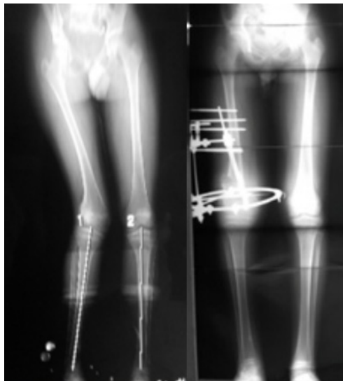
Figure 4 Case 9 (A: preoperative scannogram, B: scannogram after full correction).