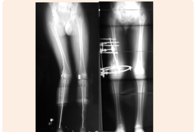
Figure 4: Case 9 (A: preoperative scannogram, B: scannogram after full correction).

When we compare our results to those of McCoy T.H. et al (2012)(8) study, we find that our study was shorter in the period of follow-up (a mean follow-up of 22.8 months in our study as compared to 81.7 months in their study) and our MSTS score was less (84.6% as compared to 93%). Moreover, we had more complications (6 versus 2) but fewer obstacles (5 versus 18). We think that this might be because we have included complicated cases with previous surgeries as cases 8 and 10 and cases who received chemotherapy as in osteosarcoma cases, which was