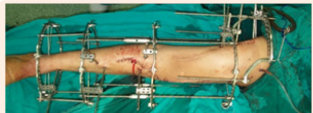
Figure 3: Application of Ilizarov frame in case 1.