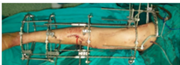
Figure 3 Application of Ilizarov frame in case 1.