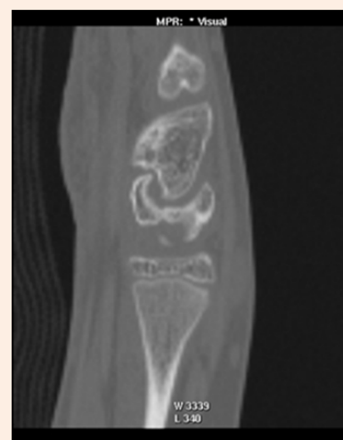
Figure 2D: Lateral view showing the extension of the volar rim of the Lunate up to the neck of the Capitate.