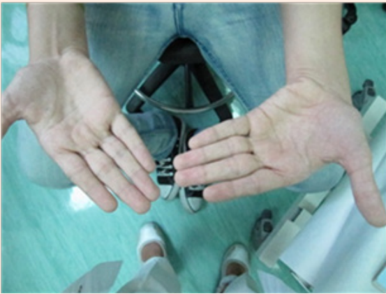
Figure 1C: Ulnar deviation comparing right with left.

For accurate diagnosis having only a conventional X-ray examination was not adequate, CT scan and even a contrast MRI test should be performed.