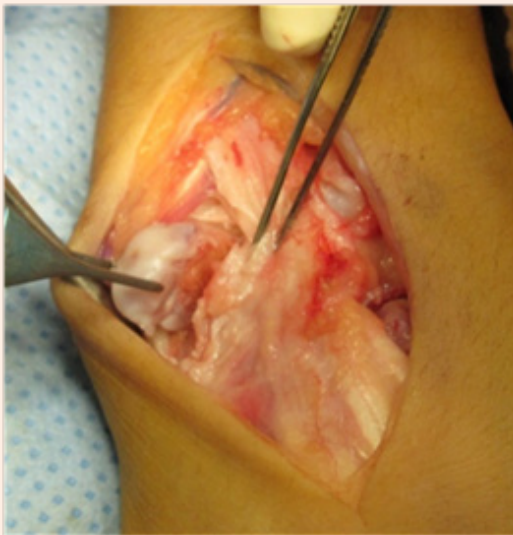
Figure 3B: Removal of ulnar extension of the osteochondroma.