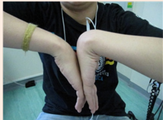
Figure 1A: Flexion right wrist compare to left side.

On examination, he presented a clear reduction of range of motion compared to his left wrist, being able only to extend it up to 50 degree (Figure 1A) and the flexion was more restricted only being able to go to 30 degrees (Figure 1B), leaving an arch of motion of only 50 degrees, his radial deviation was not restricted, but his ulnar deviation was only of 20 degrees (Figure 1C), being actually a very elastic boy, made those reduction of motion even more prominent.