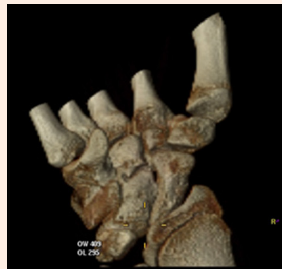
Figure 2B & C: 3D CT scan of the Lunate osteochondroma