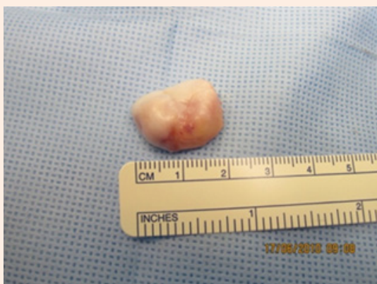
Figure 3C: Piece showing the cartilaginous cover typical of the osteochondroma.