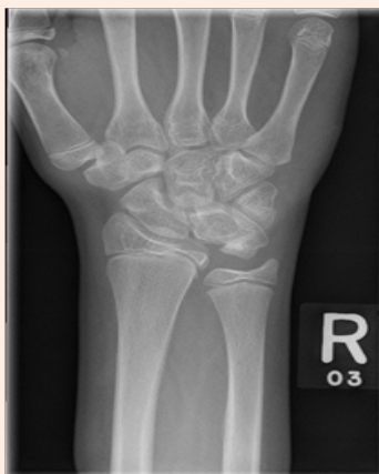
Figure 2A: PA x-ray showing the osteochondroma of the ulna

The surgery was done later on under general anaesthesia and with tourniquet control, the right wrist was approached dorsally with a longitudinal incision over the 4/5 extensor compartment, the capsule was opened with a ligament sparing technique, and a very large cartilaginous bone tumour, suggesting an osteochondroma, was found extended from dorsal to volar and to the ulnar side, sitting the main mass distal to the triangular fibrocartilaginous complex, where appeared to grow in a more round, smooth shape (Figure 3A-3D).