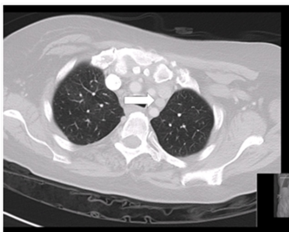
Figure 2 Patient B Ct thorax September 2010.