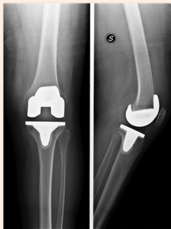
Figure 4B: Left Knee: Antero-posterior and lateral view of a left TKA (De Puy-Synthes, Warsaw, USA).