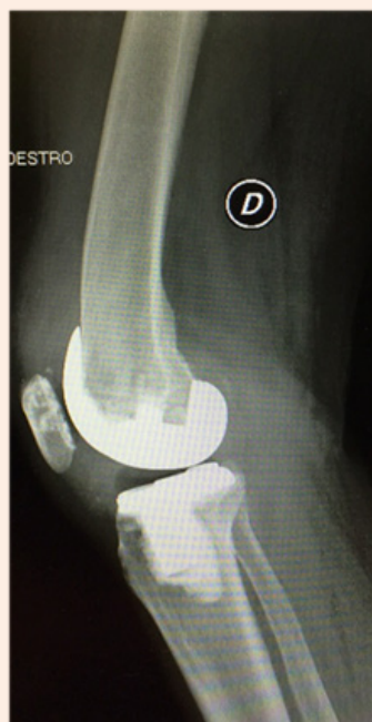
Figure 3: Right Knee: lateral x-ray. The femoral component is characterized by a J curve design (Persona, The Personalized Knee System, Zimmer, Warsaw, USA).