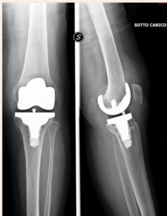
Figure 2: Left Knee: GMK Sphere TKA system (Medacta, Castel S. Pietro, Switzerland). The femoral component is characterized by a single radius of curvature.