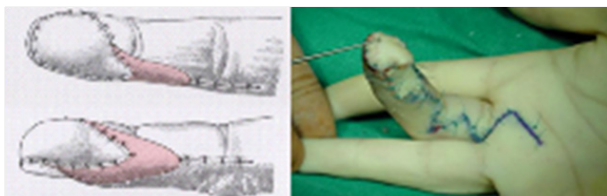
Figure 3 Coverage of the donor area with a full-thickness skin graft.