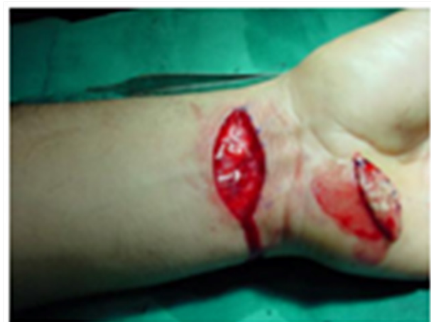
Figure 4 Donor site is covered with a full thickness skin graft, usually harvested from the palmar surface of the distal forearm.