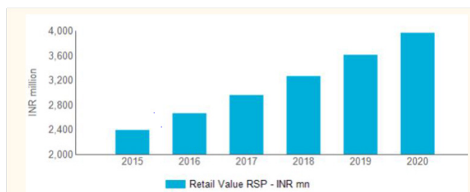
Figure 2 Market size organic packaged food-India 2015-2020.

The trend of organic food that was initiated in the developed regions such as Europe and North America has expanded to developing countries like India. Europe and North America are the largest consumers of organic food; however, the organic food market in Asia is likely to account for the highest growth rate over the next five years. In India, upcoming brands like 24 Organic Mantra, Organic Tattva are providing various organic foods like juices, snacks, oil, cereals etc. In 2015, sales of organic packaged food grew by 20% to reach Rs2.4 billion and with rising consumer awareness for organic products, are expected to further rise at a CAGR of 11% at constant 2015 prices over the forecast period, reaching Rs4.0billion in 2020 (Figure 2). 11