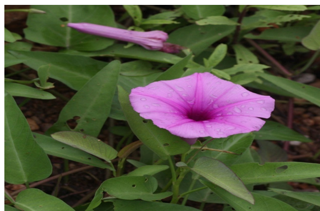
Figure 1 Photograph of Ipomoea aquatica .

The water and marsh plant, Ipomoea aquatic (Figure 1) used for this study has a creeping hollow filled stems with shining green leaves. Its stems are 2-3 meters or longer, and rooting at the nodes. The big funnel shaped flowers, 2-5cm are purple or white. It is a plant trailing or floating, herbaceous, sometimes annual or perennial. Propagation is either by planting cuttings of stem shoots that will root along the nodes or planting seeds from flowers that produce seed pods. It is found throughout the tropical and subtropical regions of the world. It is known by many names, which includes water spinach, river spinach etc. 21