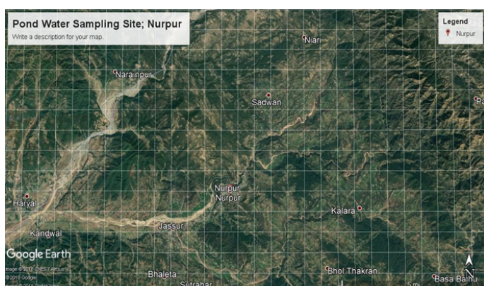
Figure 3 Location of the pond water sampling site.