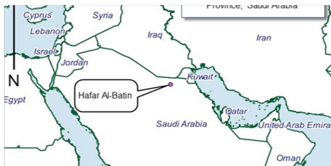
Figure 1 Location of the study area of Hafer Al batin Area in Saudi Arabia.

The floristic survey in this research paper was carried in Hafer Albatin region, which is located in the Eastern Province. It is located 430 km north of Riyadh, 94.2 km from the Kuwait border, and about 74.3 from the Iraq border. The study area lies in the dry valley of Wadi Al-Batin, part of Wadi Al-Rummah, which leads inland towards Medina and formerly emptied into the Arabian Gulf (Figure 1).