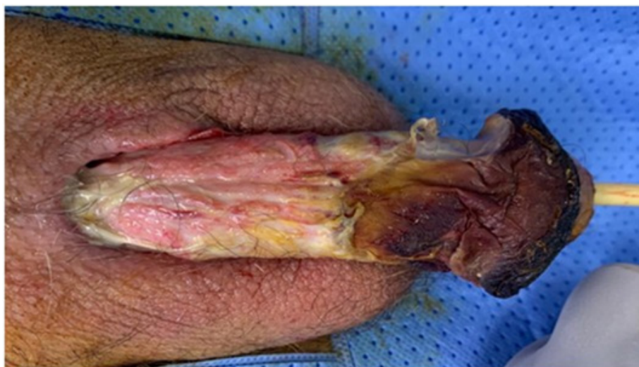
Figure 1 Dry necrosis of the cutaneous covering of the glans and the distal portion of the penis with loss of skin of the penile shaft in its proximal portion.

of the penis and blackish discoloration of the glans penis for 5 months associated with necrosis of the extremities of the upper and lower limbs. It is noted that the patient had received treatment from charlatans (Figure 1–3). There was no history of discharge, bleeding or trauma preceding the complaints. The patient also had a history of difficulty urinating. On examination, there was an area of blackish discoloration at the tip of the penis measuring approximately 3 x 3cm, with exposure of the skin of the foreskin and a rupture of the corpus spongiosum. The area of gangrene was sensitive without local elevation of temperature. Examination of the abdomen, scrotum, testicles and perineum was normal. Routine blood tests showed Hb 7, eGFR 13, serum calcium 9.3 mg/dL and phosphorus 6 mg/dL. A multidisciplinary surgical management between urologist, vascular surgeon and nephrologist was proposed. We proposed a penectomy with coverage using crossed scrotal flaps (Figure 4) and vascular surgeons for regularization of toes and finger pulps. Histopathological examination revealed calcifications in the intima of arteries with thrombosis and microabscesses in the epidermis.