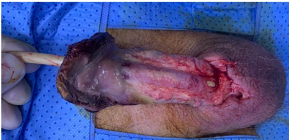
Figure 2 Loss of substance at the level of the spongy body.