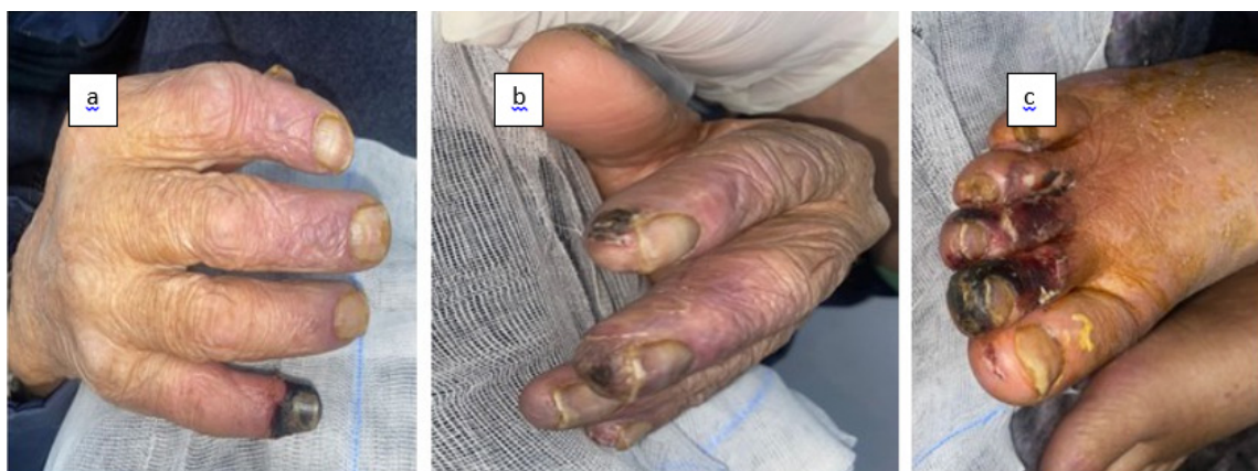
Figure 3a Dry necrosis of the pulp of the fifth finger.