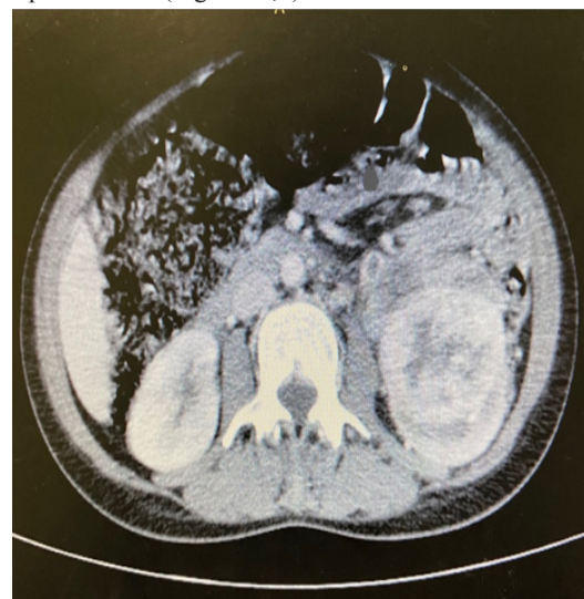
Figure 1 Computed tomography image of a massive solid lesion in the left kidney.

The abdominal image showed enlargement of the left kidney with a solid, expansive lesion that exhibited irregular contours and heterogeneous contrast enhancement, measuring 6.4cm along its longest axis, with involvement of the ureter and gonadal vein. In the pelvis, an extensive, expansive formation was identified in the bladder with a vegetative and infiltrative aspect, with uptake similar to that associated with renal injury and signs of invasion of the abdominal wall and pubic bones (Figures 1,2).