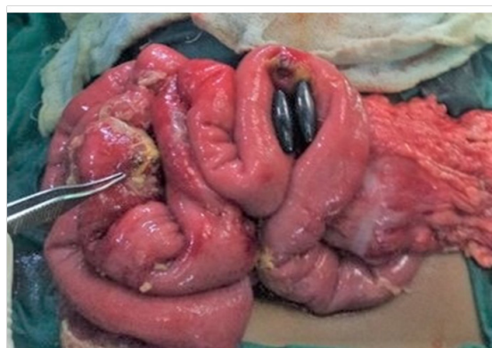
Figure 3 Intraoperative picture showing the two magnets.