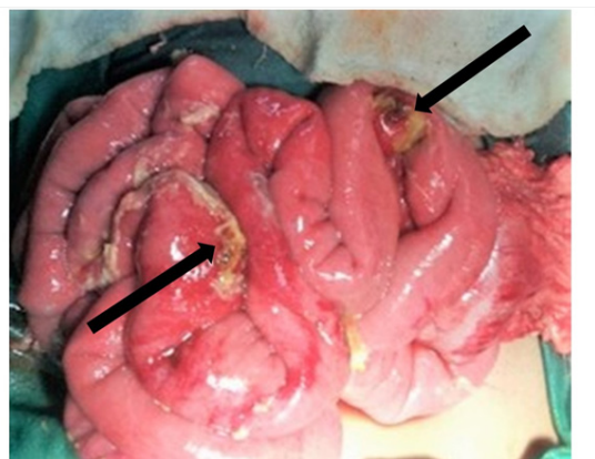
Figure 2 Intraoperative picture showing the two perforations (marked by arrows).